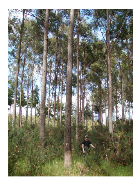
Figure 5: 10 year old E. quadrangulata plantation in Northland

Although there is limited experience with E. quadrangulata , where it has been thinned and pruned the trees have grown well (Figure 5).