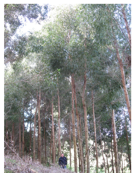
Figure 4: 7 year old E. quadrangulata plantation in Hawkes Bay

Although not planted in any formal trials r E. quadrangulata has performed very well in farm forestry plantings since 2000 in Northland, Hawkes Bay and Marlborough (Figure 4).