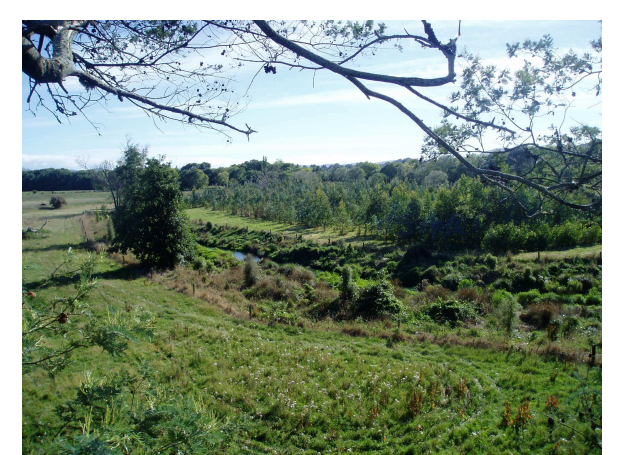
Figure 3: Masterton land treatment trial

The only formal trial that includes E. quadrangulata is a 2009 planting of durable eucalypts in a land treatment trial at Masterton. Trees in this trial have reached 5 metres tall in just over two years.