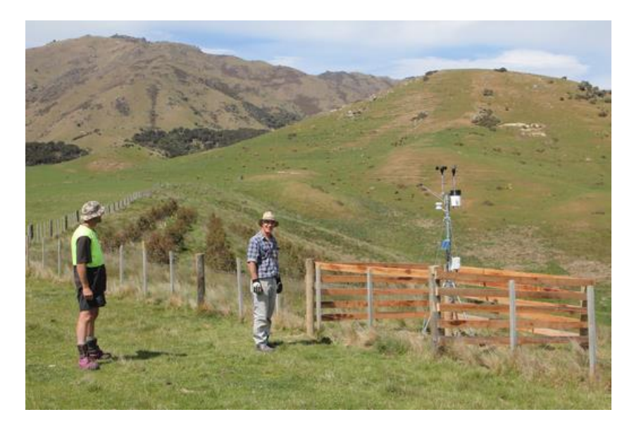
The relocated weather station at the Dillons site in Marlborough.

Two University of Canterbury students have also started working over summer in Marlborough paid under the AGMARDT project to re-measure most of NZDFI's PSP's in Marlborough and to establish new PSP's at Avery's site. In January they will travel the North Island to measure PSPs at Atkinson's and Trimble Foundation's Rewanui Farm Park both in Wairarapa. Then they move on to measure PSP's at Alexander's in Hawkes Bay and Wisharts in Gisborne.