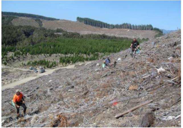
Lake Taupo Forest Trust trial being planted in pine cutover and pumice soils in late September.