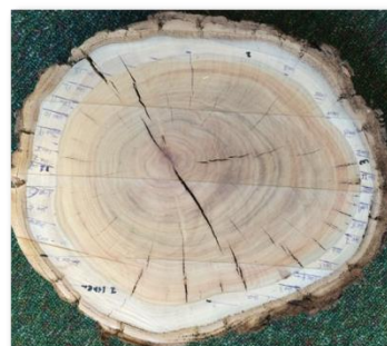
EC predicted by NIR in a 40 year old E. bosistoana disc taken at the stem base