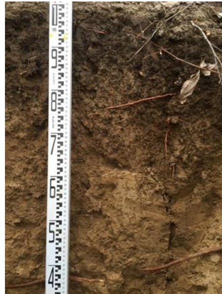
Soil horizon at Avery's site