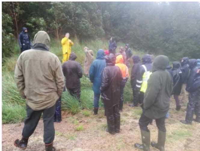
Hawkes Bay field trip attendees inspect the NZDFI's E. quadrangulata breeding populations planted in 2011 at McNeill's.