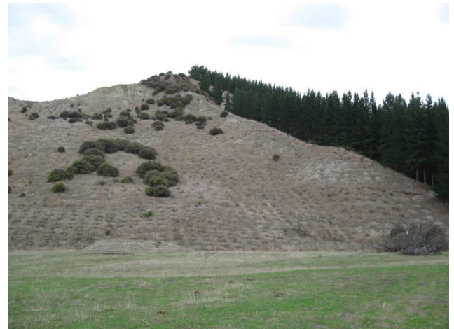
The dry slopes of the new eucalypt block planted last year by Robb MacBeth near Cheviot. Despite receiving less than 500 mm in the twelve months following planting there is good survival and some growth on most species.

Extension has continued this past 6 months. This includes links to two short videos that cover eucalypt form pruning being added to the NZDFI web site.