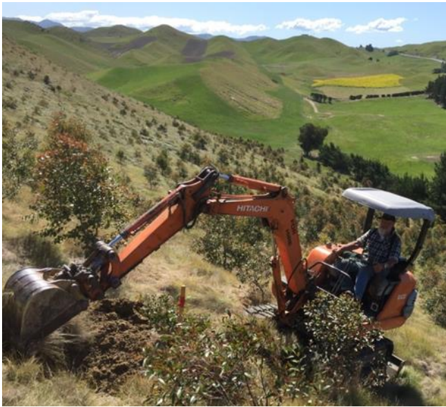
Using an excavator to dig soil pits in 2011 E. globoidea breeding population at Avery's

Twenty three soil pits have been dug at the two NZDFI sites. The soil sampling strategy covered the variation in aspect and slope. Due to the extremely hard soil an excavator was used. Soil horizons have been measured and from each pit four samples were brought back to the laboratory for physical soil properties measurements.