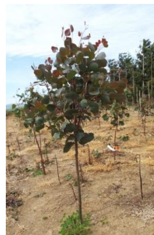
E. bosistoana planted in February 2015 at Woodville following pruning in November.

In September a propagation workshop was held with representatives from several commercial nurseries following which a work programme to assess the coppicing and transplanting ability of E. bosistoana root stock was initiated. This demonstrated that lifting young E. bosistoana plants that have been cut for growth-strain analysis without prior root-pruning/undercutting is not straight forward. The risk of losing plants is high.