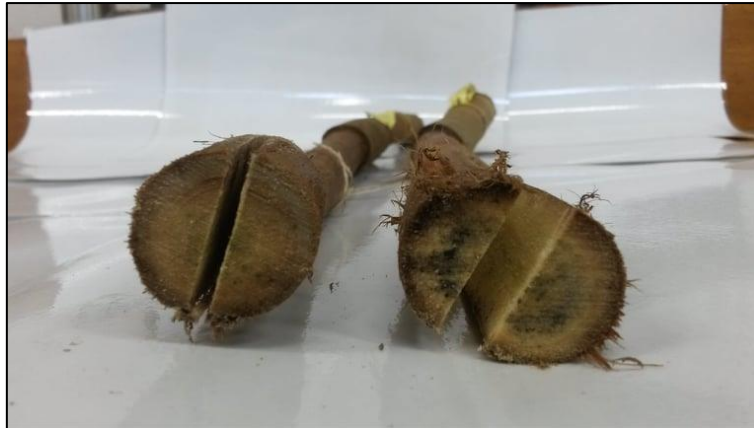
Figure 1. Two samples split parallel to the stem direction for growth strain measurement.

perpendicular to the split plane and the size of the opening created from the split was measured using electronic callipers. For diameter, 1.7 mm was added to the measurements to account for the kerf of the bandsaw.