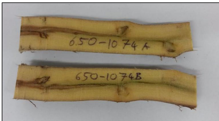
Figure 2. One sample cut into half-prongs, side A and B.

After the measurements required to determine the growth strain were taken, each stem sample was trimmed to yield two 15 cm half-prongs using a cross-cut saw. The half-prongs were designated ‘side A’ and ‘side B’ to keep track of the individual stem samples (Fig. 2). The mass of the half-prongs was measured using a balance. The volume was measured using the gravimetric water displacement method.